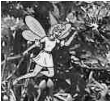
Figure 4.1. The Fairy provides directions.

It cannot be assumed that the children will be able to read directions. Thus the fairy became the direction-giver throughout. Clicking on the fairy in any screen will always provide directions on what to do or how to play a game.