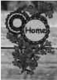
Figure 4.5. Home Button

It is important that a child can return to the Home Screen at anytime and begin a new game or make the fairy count the numbers. Clicking on the flowers at the bottom left corner of any screen will return the child to the main/home page.