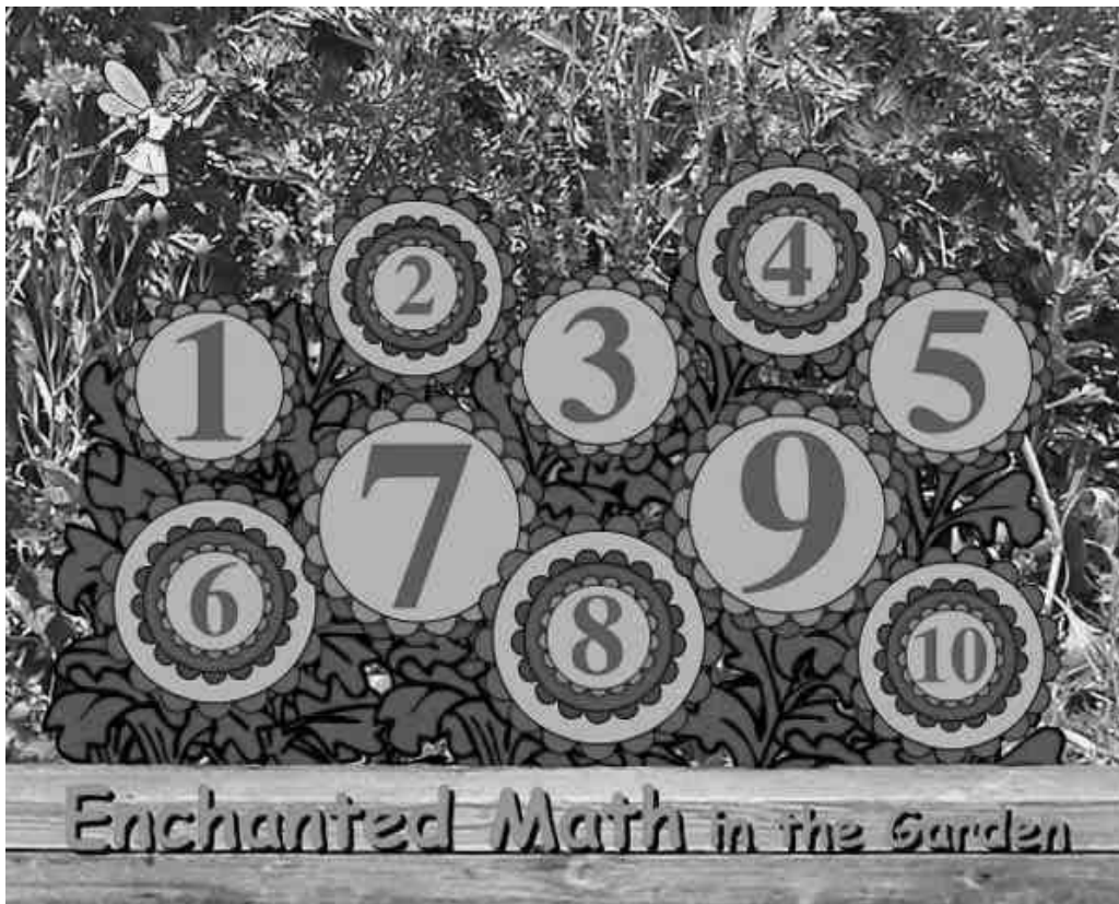
Figure 4.3. Main/Home Screen

Children who need reinforcement counting from 1-10 can follow along with the fairy as the numbers are sung in the proper sequence. The counting melody used was intended to be memorable so the child might sing the melody while repeating the numbers in sequence. The melody used was child-composed, by Mike Lownds, a seventh grader.